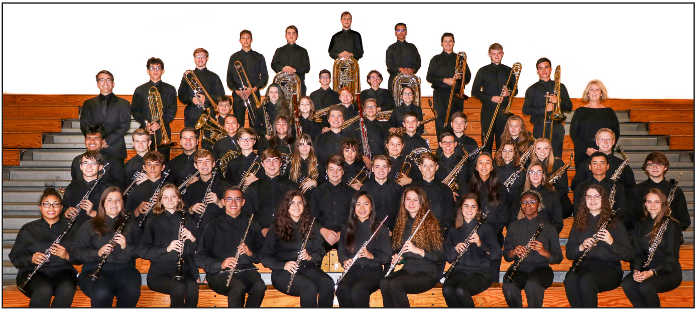
Viera High School Wind Ensemble